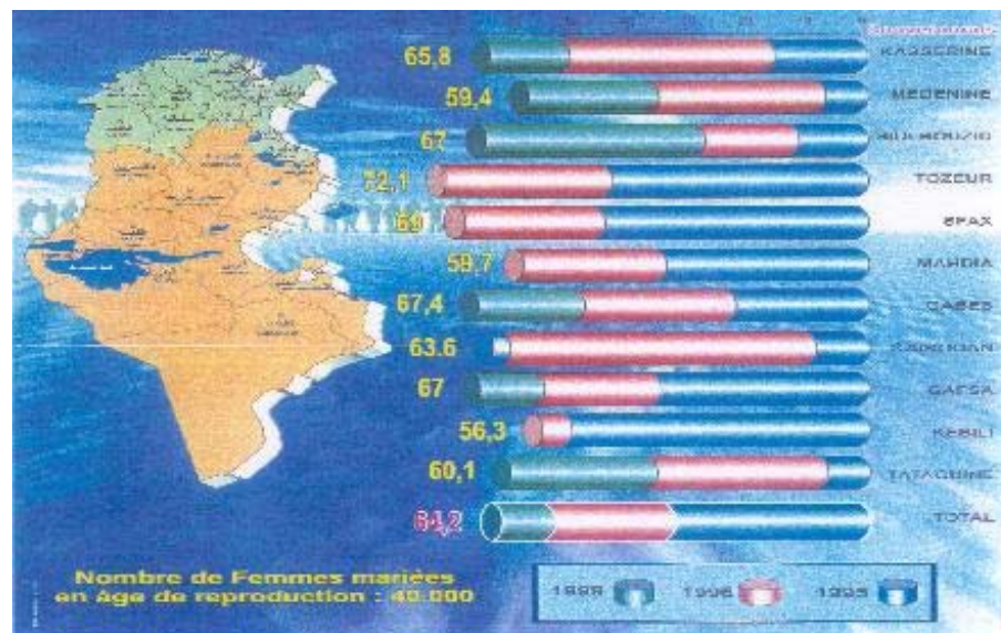
Contraceptive rate in underprivileged areas supplement region by region (1995-1999)

In addition, the program has had a direct impact on improving the levels of health cover in the provinces concerned, particularly with regard to contraceptive prevalence. In fact, it added more than 12 points to the contraceptive use average in province of Tataouine and more than 8 points in province of Kasserine.